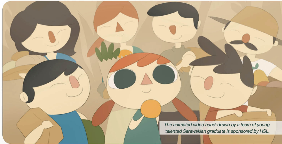
The animated video hand-drawn by a team of young talented Sarawakian graduate is sponsored by HSL.