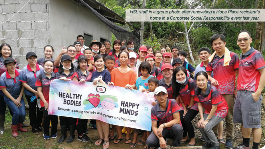
HSL staff in a group photo after renovating a Hope Place recipient's home in a Corporate Social Responsibility event last year.