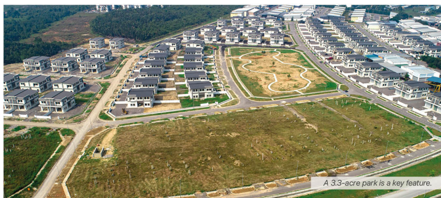
A 3.3-acre park is a key feature.

Search #VIPHSL on Facebook, Instagram and Youtube to view photos and informative videos on this ideal business location.